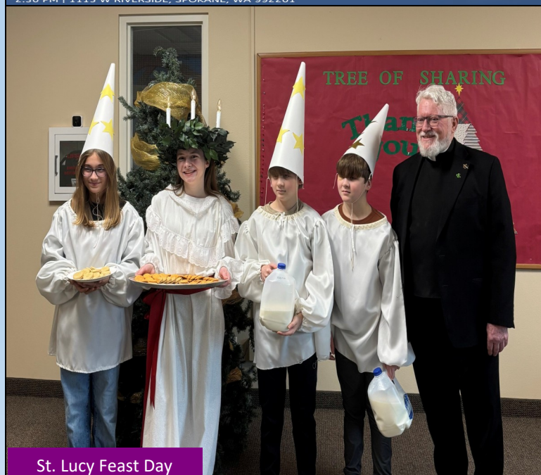
St. Lucy Feast Day

CATHEDRAL OF OUR LADY OF LOURDES 2:30 PM | 1115 W RIVERSIDE, SPOKANE, WA 992201